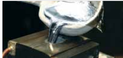
Casting molten aluminum for handles