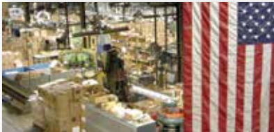
Partial view of shop floor